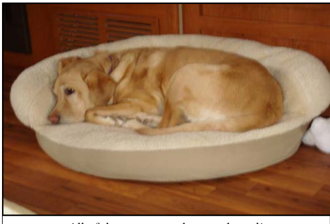
All of this activity makes a girl tired!

If she could talk, she could tell you everything that is happening around the camper. Abbey thinks camping is a social event. When she is inside the camper, she is usually at one of the windows watching something or someone. When someone walks by, she stands at the window wagging her tail knowing there is a good chance they are going to come to the window to talk to her.