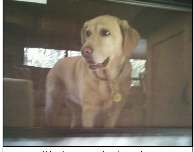
Abbey keeping watch at the window.

If she could talk, she could tell you everything that is happening around the camper. Abbey thinks camping is a social event. When she is inside the camper, she is usually at one of the windows watching something or someone. When someone walks by, she stands at the window wagging her tail knowing there is a good chance they are going to come to the window to talk to her.